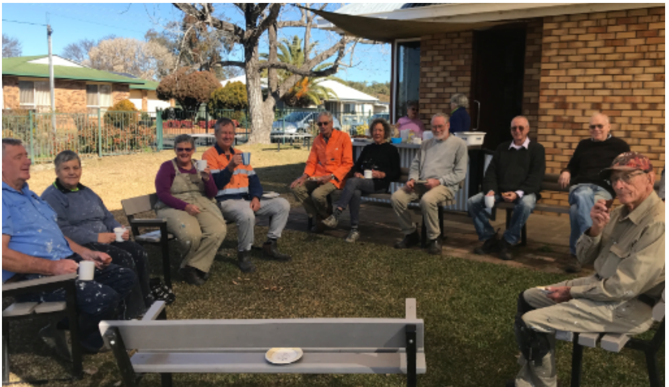
MMM Team, who arrived for the second time, to help with the Parish Hall project in July 2022.