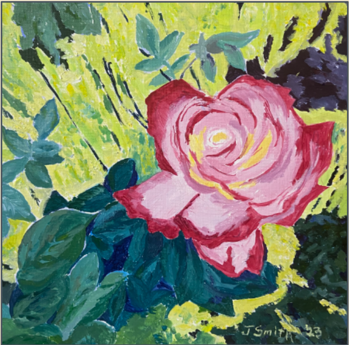
'In Kay's Garden' © 2023 Janelle Smith. Used with permission.