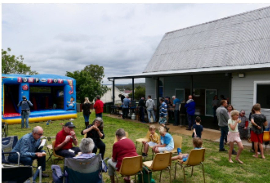
Parish Hall Open Day, 8 th October 2023