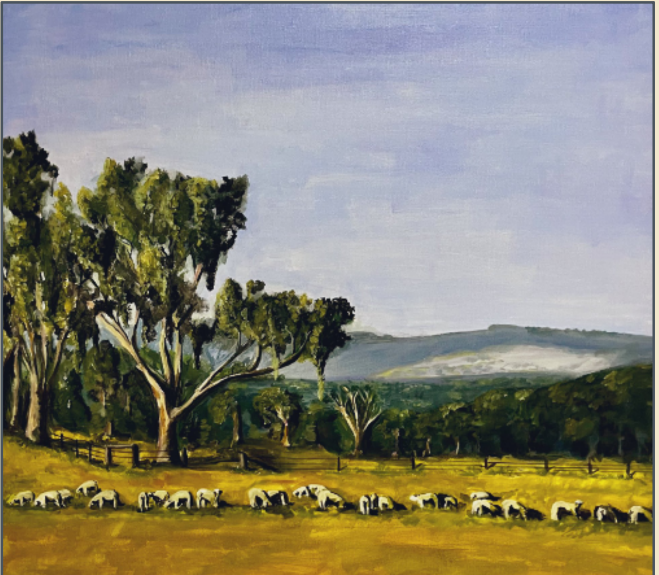
'May Morning' © 2023 Ardina Jackson. Used with permission.