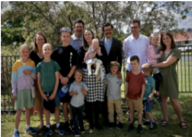
Our family at the kids' baptism, with their Godparents & families.

I am so encouraged to see and hear of many people around the parish caring for others in their day to day lives - meeting in homes and in town, cooking meals for others, reading the Bible and praying with each other. This is all part and parcel of our life together as God's people. Be encouraged! And keep it up!